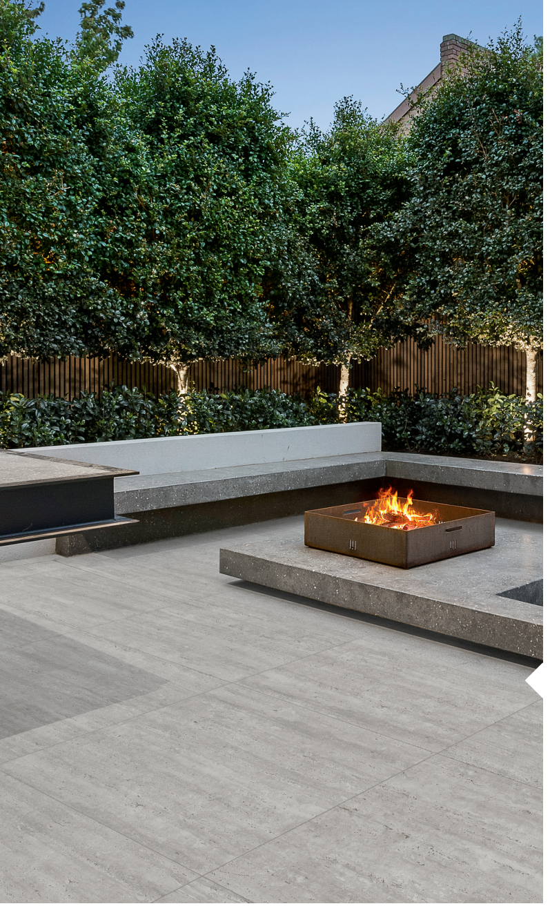
Argos, Tívoli (80x30, 80x80, 120x120 and 120x300 cm) www.grecogres.com